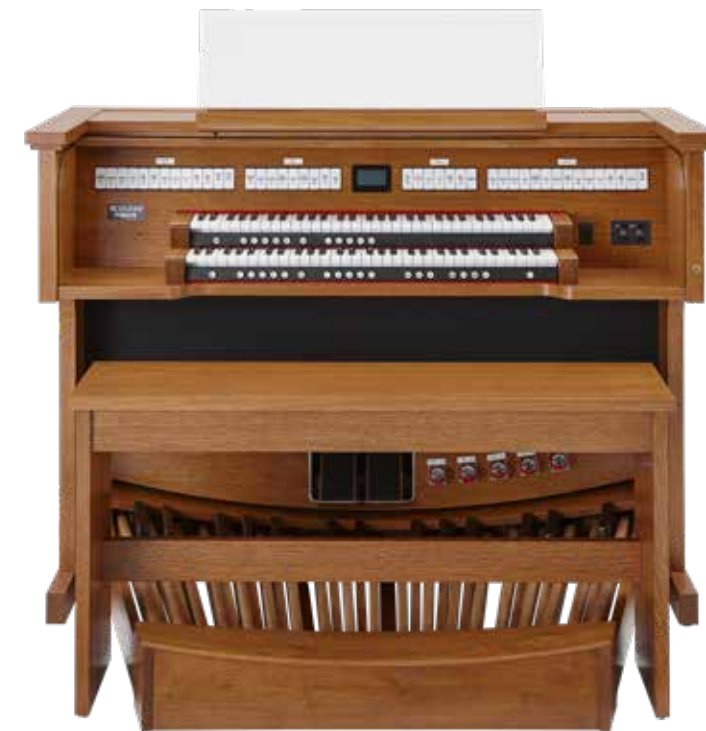
INSPIRE SERIES 233

The organ – available in an oak design in different colors – features two keyboards, a 32-note pedalboard, and 33 original voices in the standard stop list. The innovative Voice Palette™ system allows for the combination of an infinite mix of voices in the various styles. This means the Inspire Series 233 is not just designed to give the freedom to perform any style, but also – to inspire the gathering with celestial music.