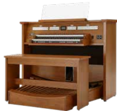
INSPIRE SERIES 227