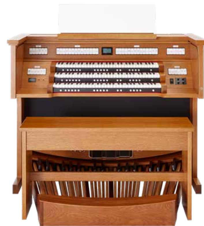
INSPIRE SERIES 343

In addition to the standard stoplist – American Eclectic – stops can be selected from the English Cathedral, French Romantic and German Baroque styles. The Variant Library consists of extra stops to choose as desired. The organist is not limited to stops from only one style; all are available instantly. For those who appreciate a large variety of sounds the Inspire 343 is an ideal choice.