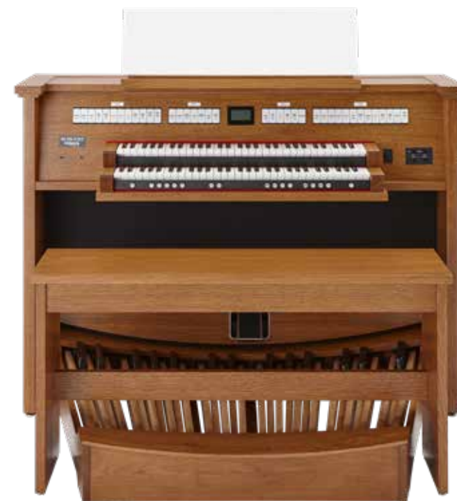
INSPIRE SERIES 227

The innovative Voice Palette™ system provides a total of 135 high-quality pipe organ voices. The organist can experiment with an infinite combination of voices in the various styles, and have access to orchestral voices, such as piano, harpsichord, harp, strings, trumpet, clarinet, and handbells. The Inspire Series 227 is equipped with an integrated 2.1 audio system which will bring the pipe organ and orchestral voices to life.