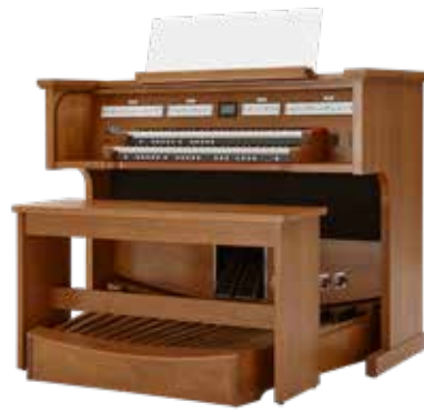
INSPIRE SERIES 233