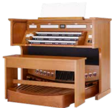
INSPIRE SERIES 343